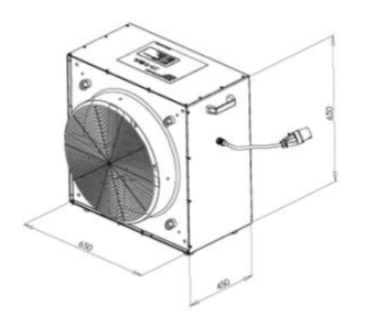
Upper chamber fan 20'